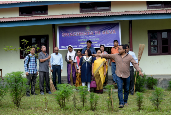
Swachhata Hi Seva

*** Students studying in 1 st to 4 th Semesters should be treated as studying in General Courses. They have to select one of the three elective subjects they have studied during previous semesters as Honours Subject for undergoing Honours Course in 5 th Semester. They should pursue same Honours subject in 6 th Semester also.