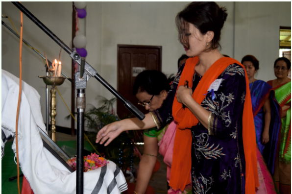
Teachers Day Celebration