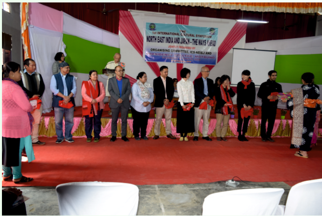
Japanese Deligate for International Symposium