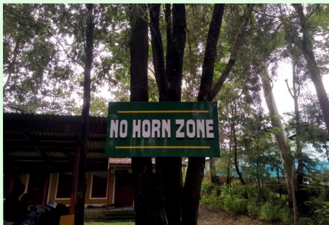
Presidency College, Motbung

The professor of both streams of Arts and Science in Presidency College take up different minor and major projects funded by U.G.C.