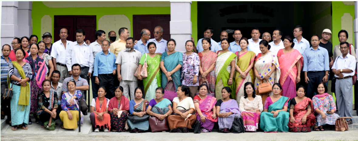
Teaching & Non Teaching Staff, Presidency College